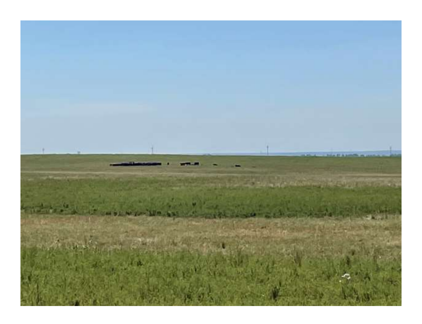
Farm #44—Located at the corner of Douglas Road and North County Road 11. Farm 44 was added to the grazing program this year and cattle are pictured in the background of the photograph.